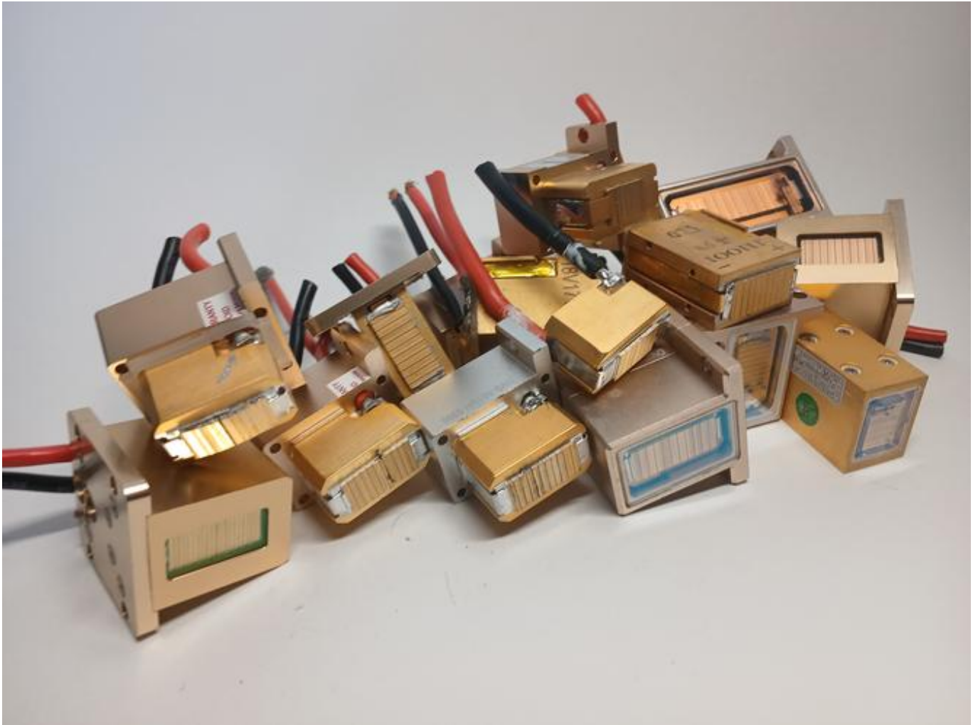
Laser pen restoration module