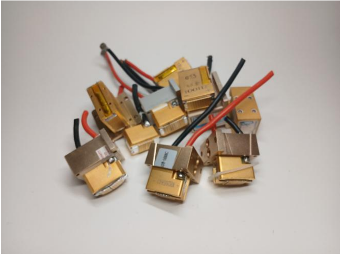
Lenses and filters of the diode apparatus